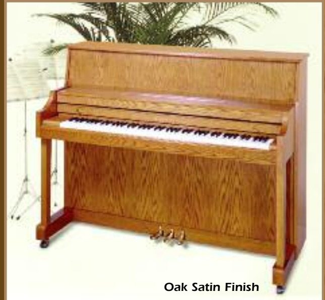
Oak Satin Finish

The 506N embodies three fundamental elements of a fine piano... an exceptional soundboard made of solid spruce, a durable back assembly with sturdy back posts, and our exclusive Ultra-Responsive™ Direct Blow Action. These important elements ensure a level of tone, touch and durability that will satisfy the needs of any pianist.