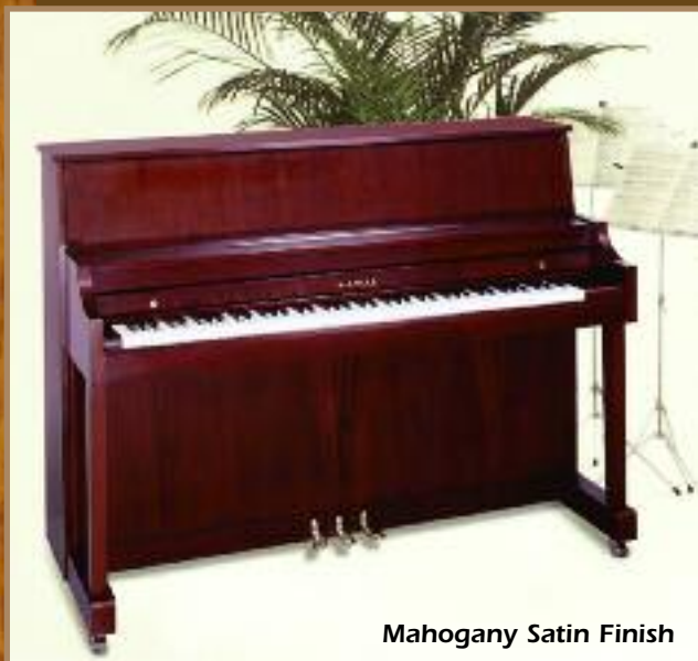
Mahogany Satin Finish

For optimum tone, the 506N was created with a taller 44 1/2" height and an extended scale design that offers a large soundboard area (2,015 square inches) for a fuller, more resonant tone. To provide superior touch, our Ultra-Responsive™ Direct Blow Action is fitted with selected parts made of ABS Styran – a material chosen for its exceptional strength and its ability to resist shrinking and swelling due to climatic changes. The use of ABS Styran is one of the prime reasons why Kawai actions are described as the most precise piano actions in the world.